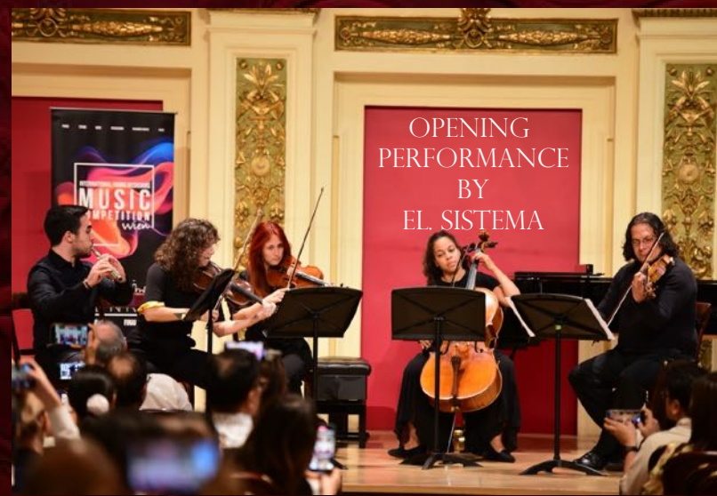
OPENING PERFORMANCE BY EL. SISTEMA