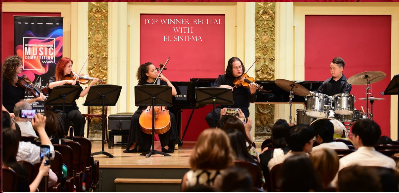
TOP WINNER, RECITAL. WITH EL. SISTEMA